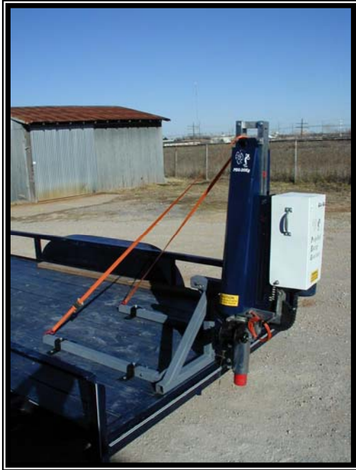
PEG-40kg Mounted on Trailer Using Optional Universal Hitch