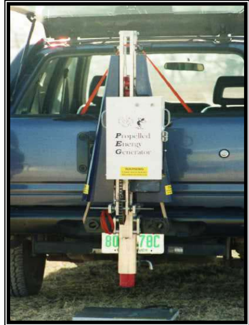
PEG-40Kg Mounted on Small SUV with U.S. Standard 2" Receiver